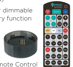
Sensor and Sensor Remote Control